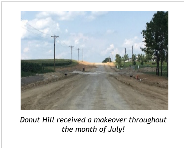
Donut Hill received a makeover throughout the month of July!